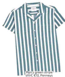
Men's green stripe shirt, €13, Penneys