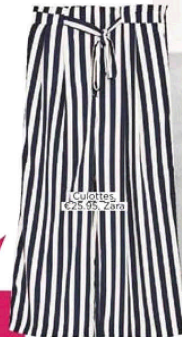
Colores (€25.95, Zara)