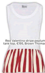
Red Valentino stripe peplum tank top, €395, Brown Thomas