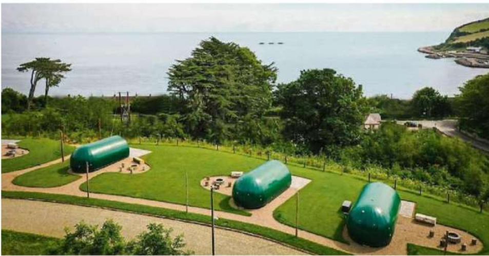
Further Space pods look out to sea at Glenarm Castle.