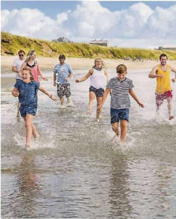
Ballyhorman beach in Downpatrick boasts a long stretch of sand, as well as kayaking.