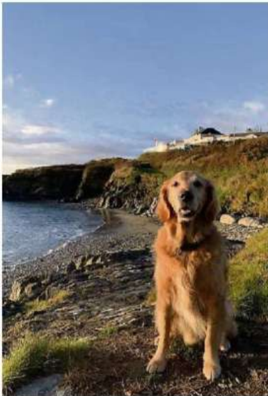
Dog-friendly Dunmore House in Clonakilty is a great spot to bring your pooch.