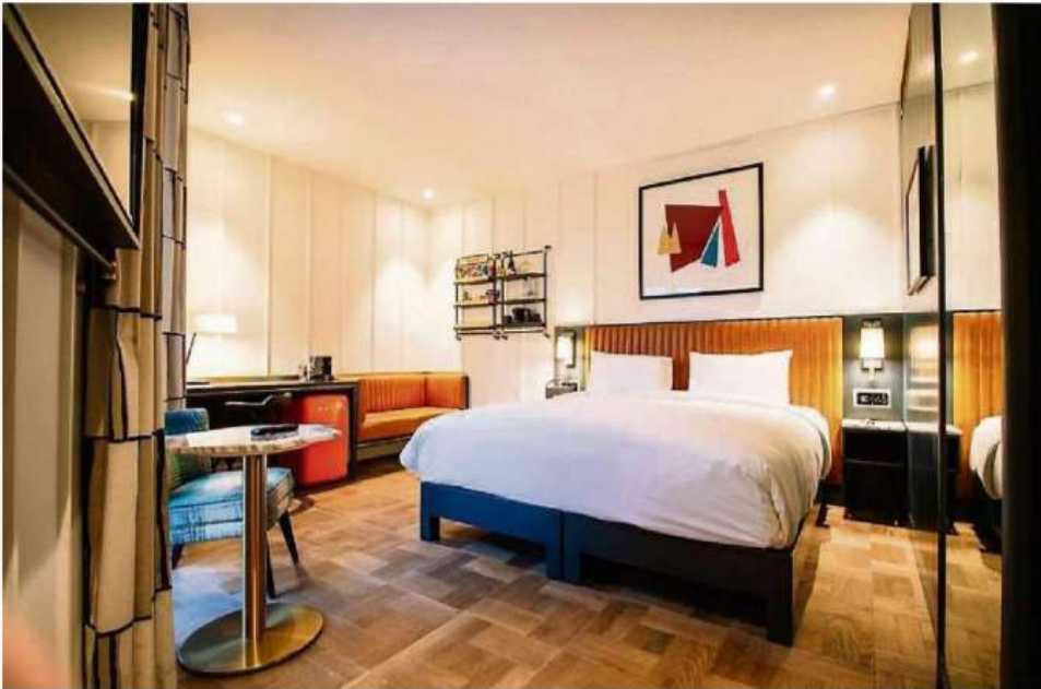
The Dean, Cork, offers modern pod rooms, bursting with quirky extras.