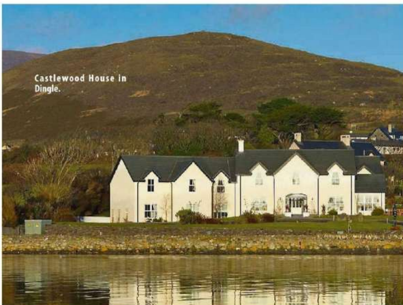
Castlewood House in Dingle.