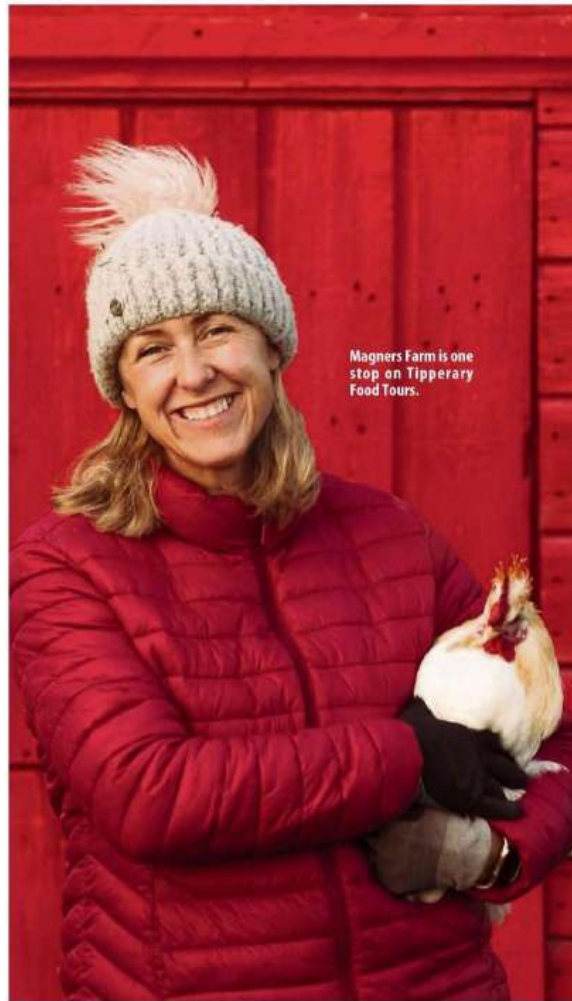
Magners Farm is one stop on Tipperary Food Tours.

age is expertly designed with high-end interiors and set on a 140-acre private farm with chickens wandering freely and a polytunnel of beautiful bounty on your doorstep. The property makes an ideal base for couples who love the great outdoors, with an array of activities in the area including mountain biking, fishing, surfing and many more. This summer will see the arrival of a geodesic dome on site, with plans for more modern woodland cabins next year. €450 for a three-night minimum. ■ fernwood.eco.