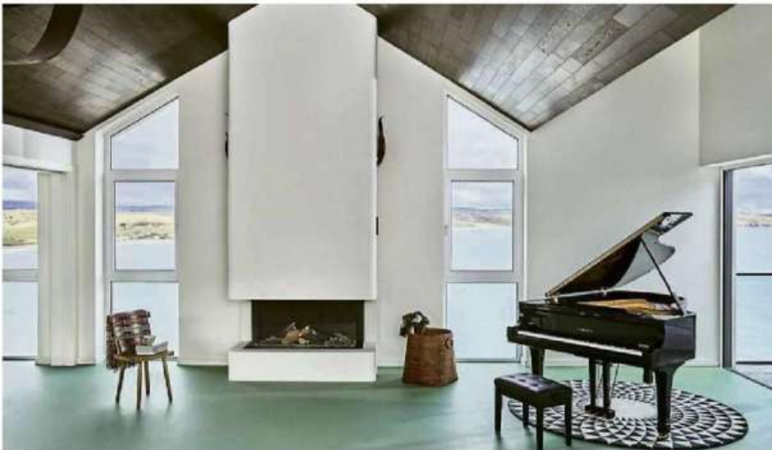
The main living room at Cliff Beach House (left) and Clare Island lighthouse (right) — a holiday the family will remember.

Venture north to Rathlin Island to views its seal colony.