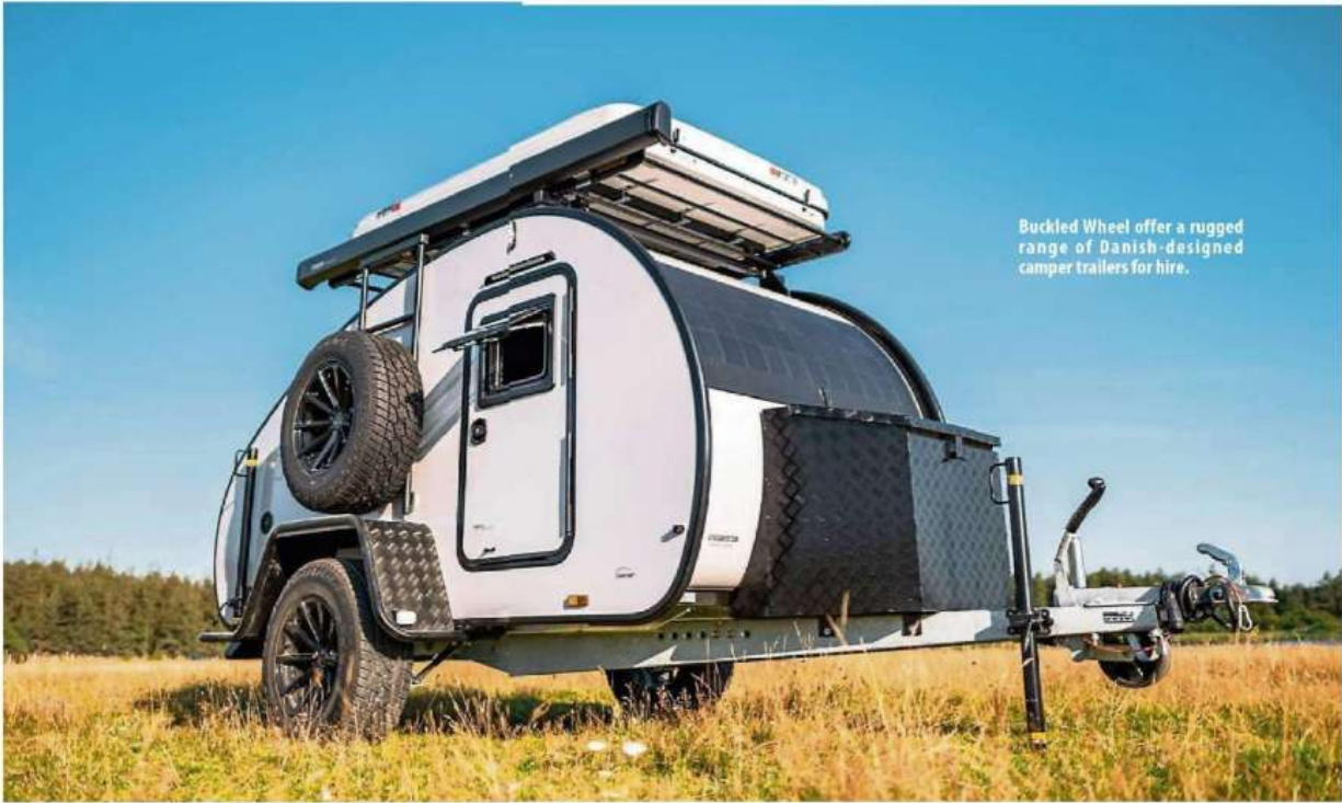
Buckled Wheel offer a rugged range of Danish-designed camper trailers for hire.